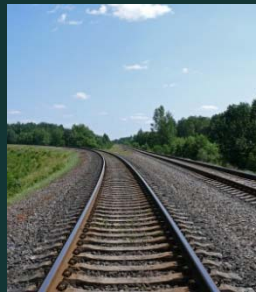
EPC & International Division