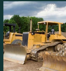
Equipment Management Division