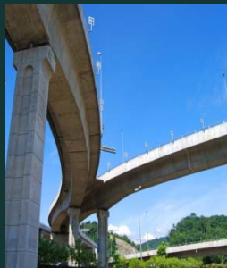
Construction & Contracts Division