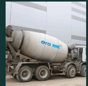
Ready Mix Concrete Division